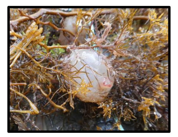
Herdmania fimbriae, ascidian

Miscellaneous: Crabs (tiny) x3, Herdmania fimbriae , ascidians x12; Bryozoan (crusty ring around the stem of a seagrass) and a pink sponge